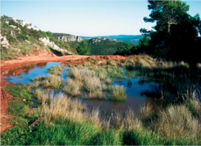
The pond behind Castell de Selmella

river, that of Selmella, on the other hand, is from the earlier foundations on the right bank, in a clear attempt to penetrate the La Conca region, at the time in the hands of the Saracens.