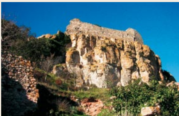
The remains of the Castell de Selmella

In the middle of the 19th century, although Selmella had its own identity, it was actually part of the municipality of Pont d'Armentera. The village was listed as having only three inhabited masies and a total 69 inhabitants. In the first decade of the 20th century, the houses were still standing but, by 1952, only one remained inhabited. The village's location, the shortage of agricultural terrain in these parts, the lack of good communications and the area's general isolation led its inhabitants to leave in search of better living conditions.