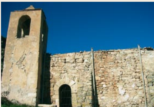
Església de Sant Llorenç