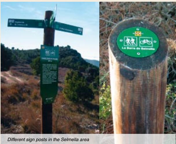
Different sign posts in the Selmella area

In the 10th and 11th centuries, the oldest and most important castles of all on the defence line of the Gaià had been built on the left bank of the