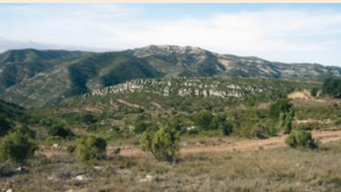
The line of the Cogulló crest seen from Castell de Selmella

Junction next to land planted with young trees. We continue along the main track leaving the one to the right, which goes towards the cultivations and comes to the demolished Cal Cases masia. Before very long the track becomes much steeper.